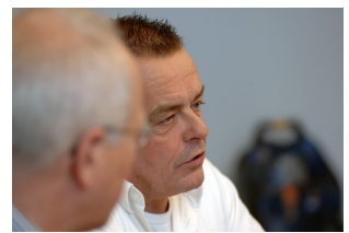
NABER PLASTICS WAALWIJK NABER PLASTICS WAALWIJK NABER PLASTICS WAALWIJK NABER PLASTICS WAALWIJK 20141104_WAALWIJK_JST8... 20141104_WAALWIJK_JST8... 20141104_WAALWIJK_JST8... 20141104_WAALWIJK_JST8...