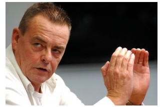
NABER PLASTICS WAALWIJK NABER PLASTICS WAALWIJK NABER PLASTICS WAALWIJK NABER PLASTICS WAALWIJK 20141104_WAALWIJK_JST8... 20141104_WAALWIJK_JST8... 20141104_WAALWIJK_JST8... 20141104_WAALWIJK_JST8...